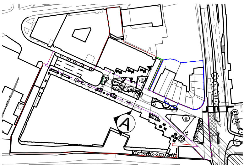
Section Location Plan