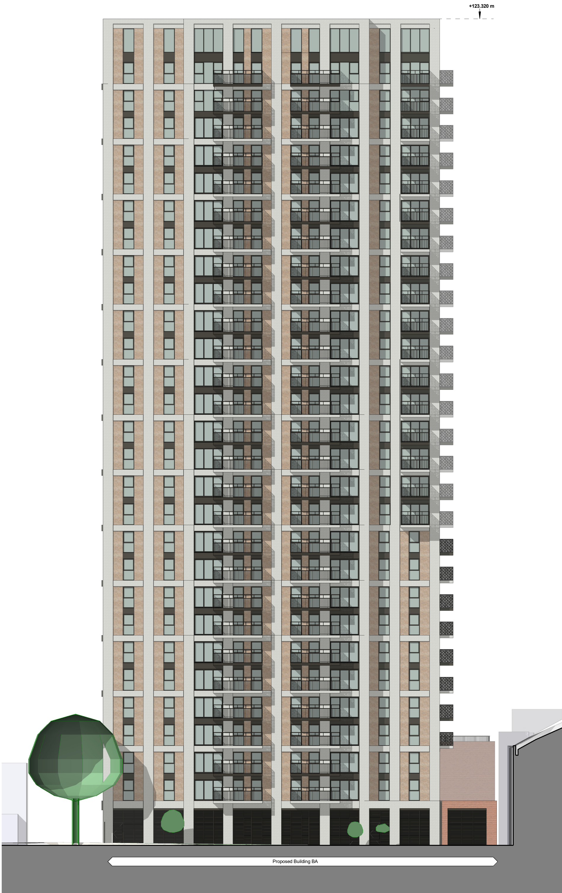
Proposed Elevation JJ 1 : 250