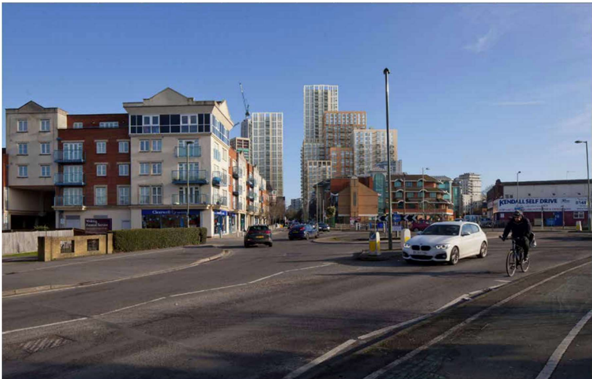
Current Planning Application