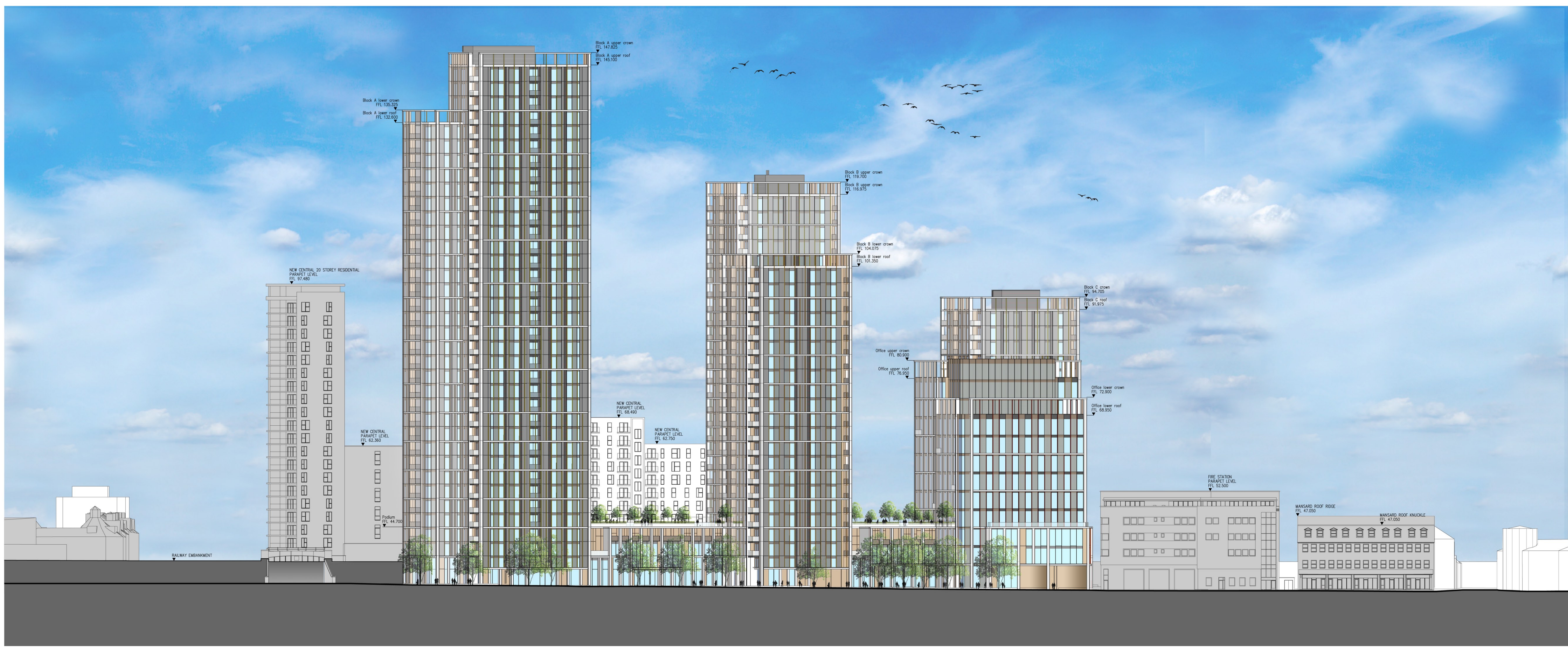
Goldsworth Road Elevation