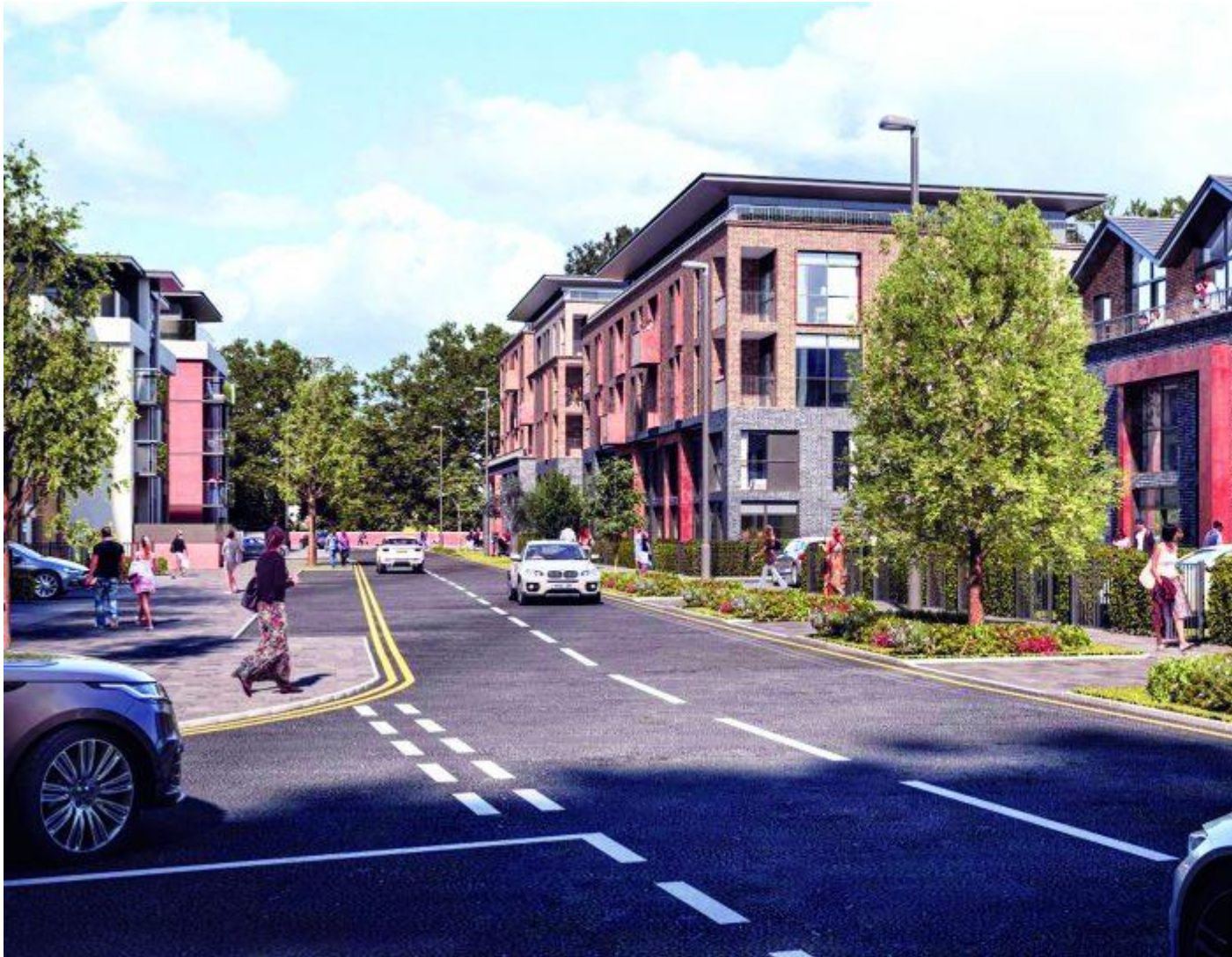
The computer-generated proposal of how the new homes would look

The project by GolDev is an alternative to its Cardinal Court scheme involving a 9,000-seat new stadium and more than 1,000 adjacent flats that has been refused planning permission and is now subject to an appeal.