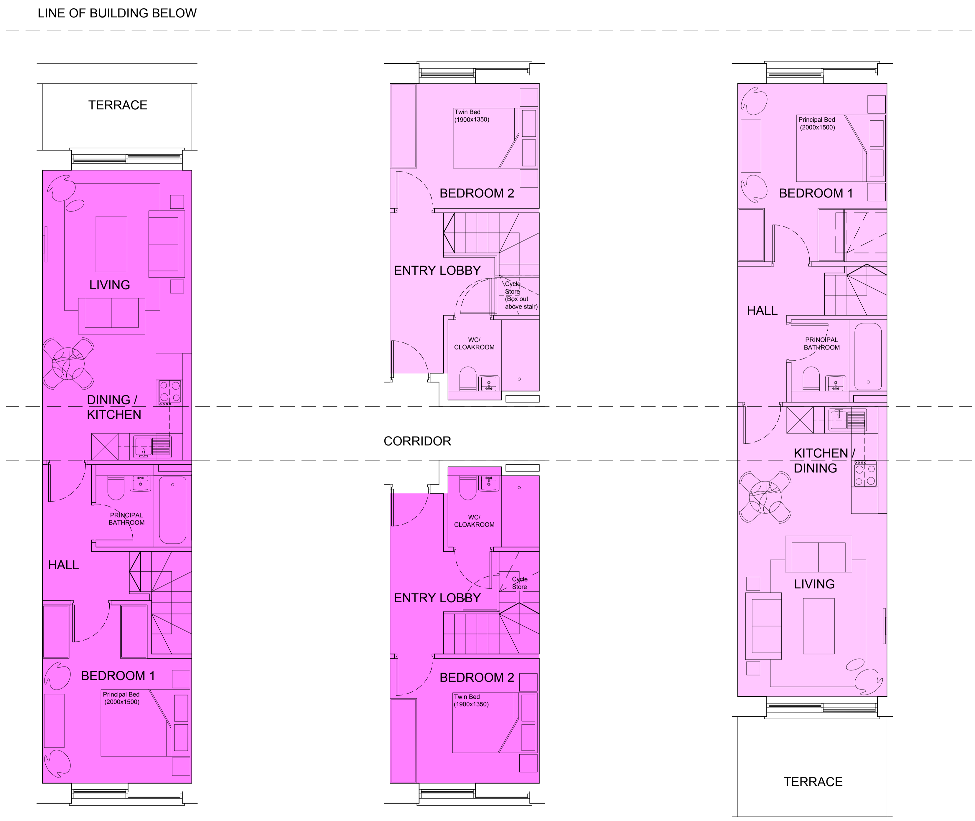
2 BED DUPLEX UPPER LEVEL

NOTE: FOR EXTERNAL SPACES REFER TO GENERAL ARRANGEMENT PLANS