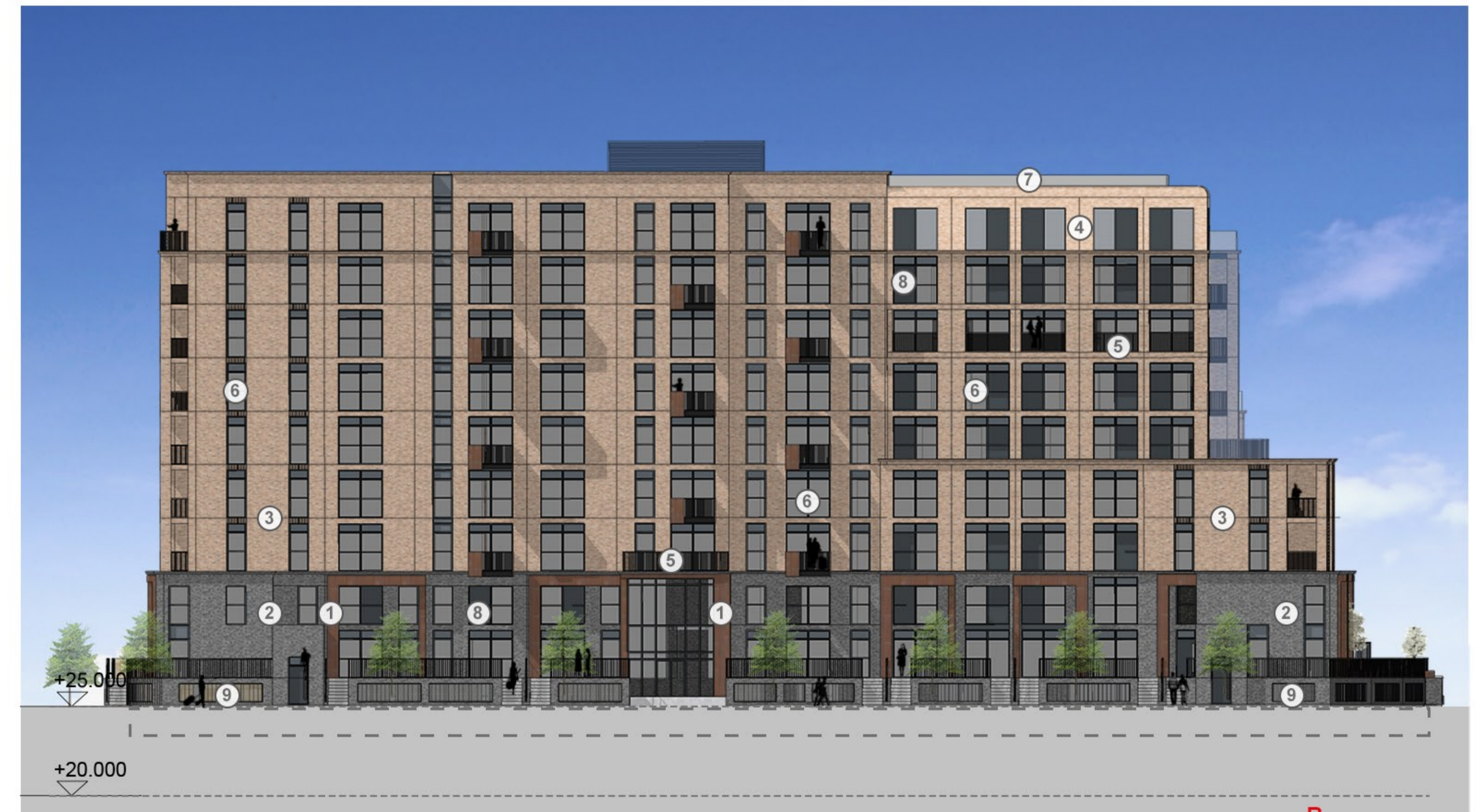
ELEVATION D - FACING WEST/BLOCK 4