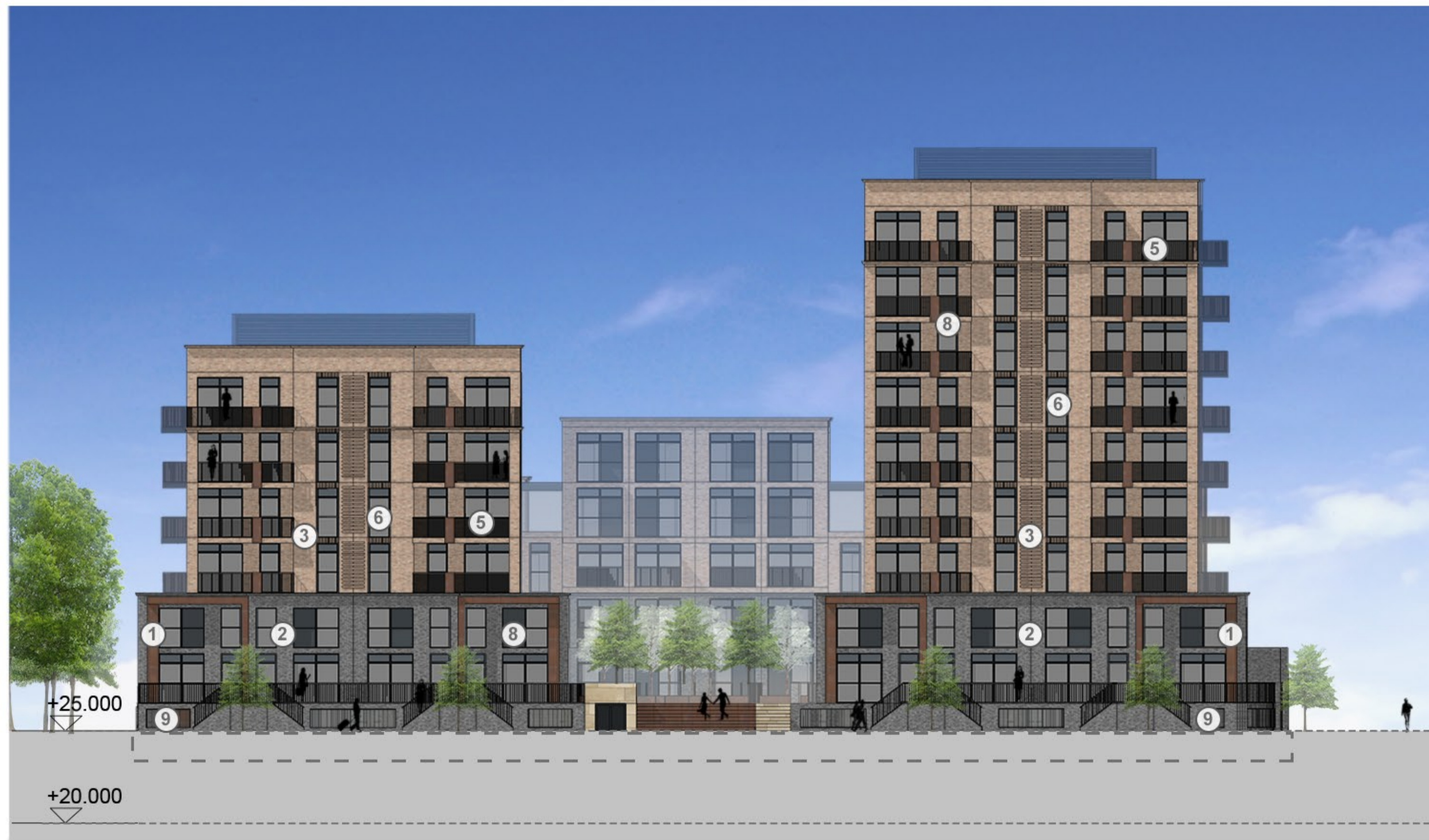
ELEVATION C - FACING NORTH/NEW STREET