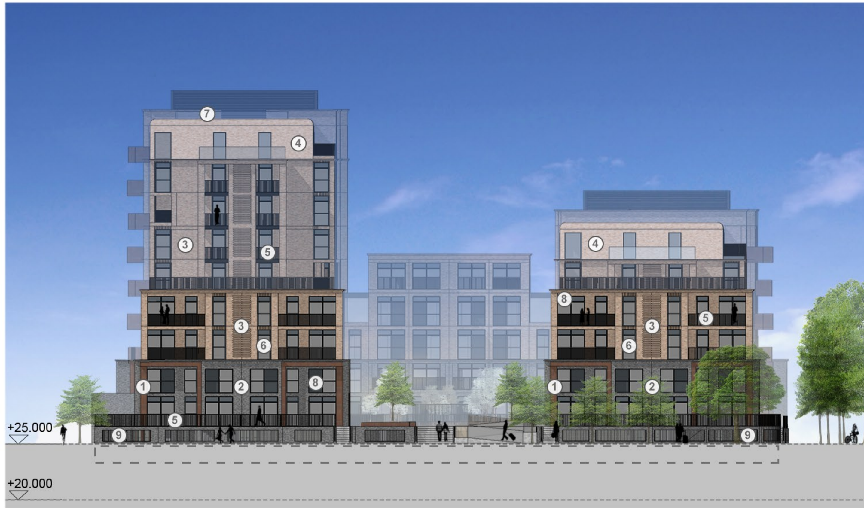
ELEVATION A - FACING SOUTH/PLAYING FIELDS