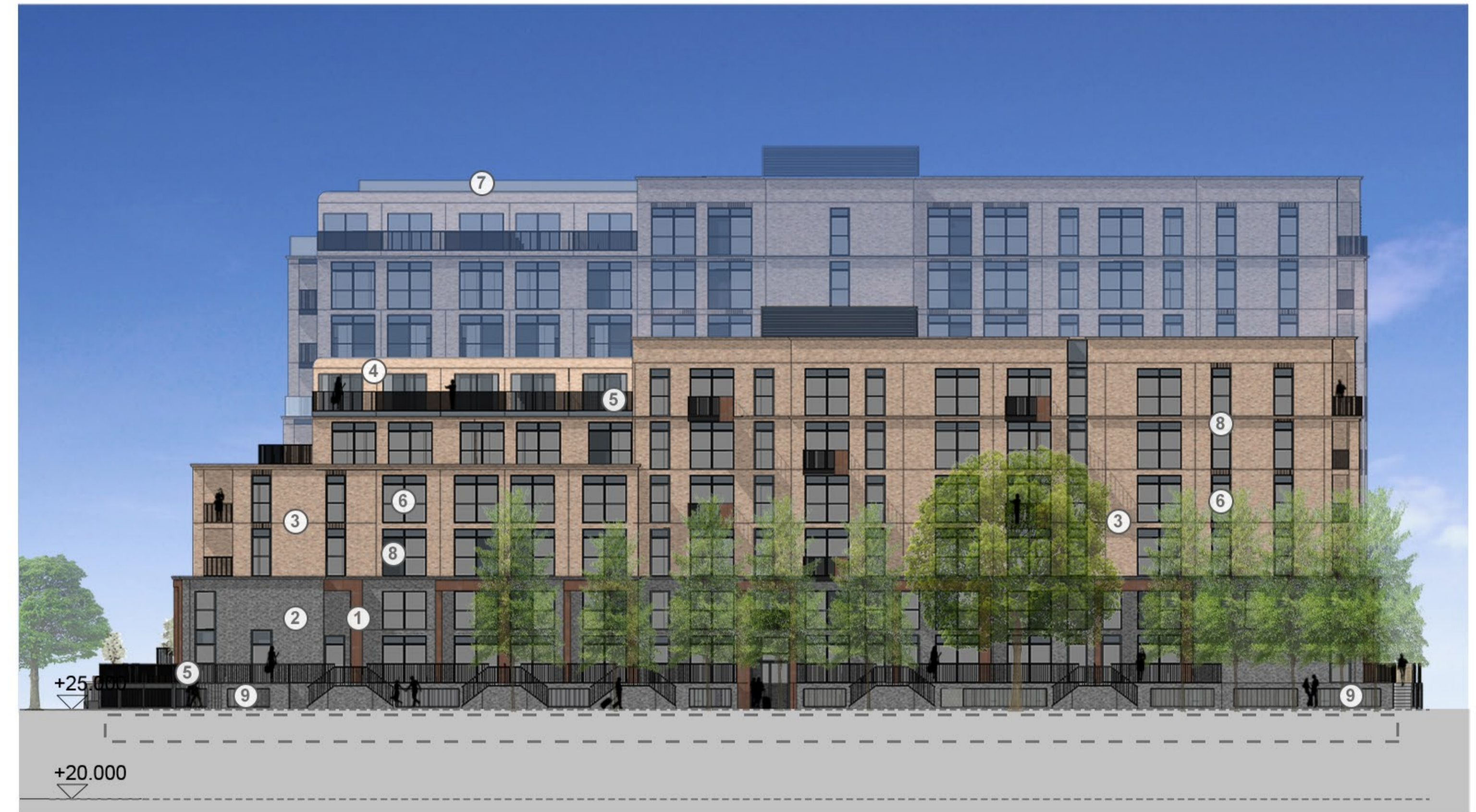
ELEVATION B - FACING EAST