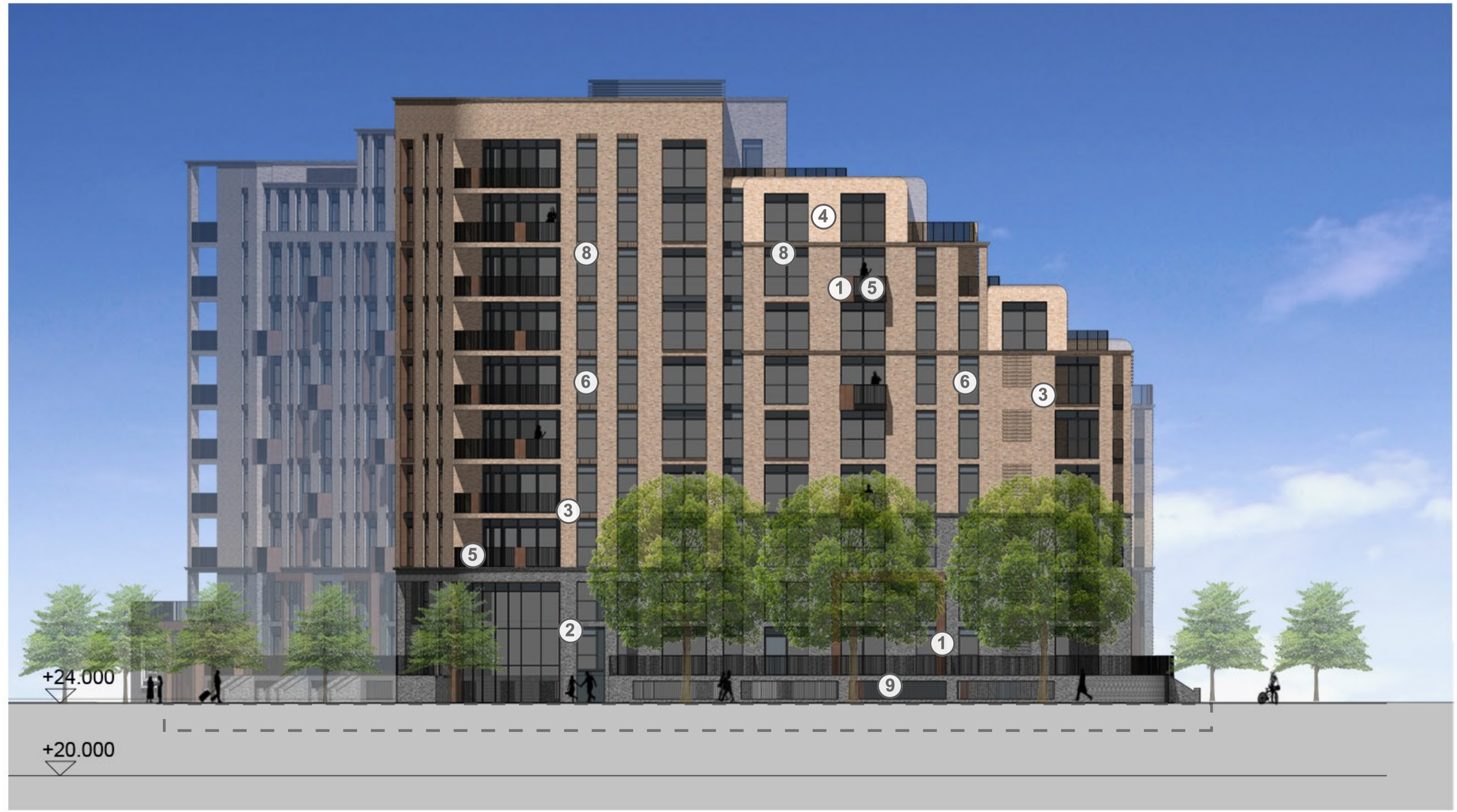
ELEVATION D - FACING NORTH/KINGFIELD ROAD