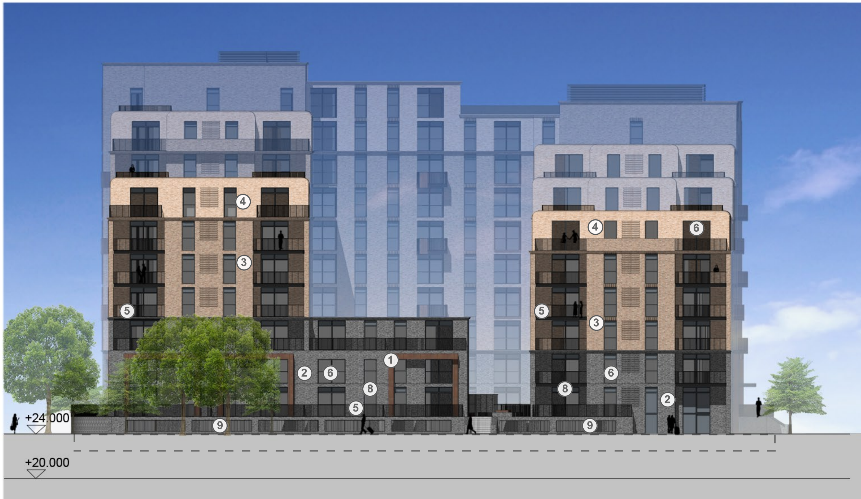
ELEVATION A - FACING WEST/WESTFIELD AVENUE