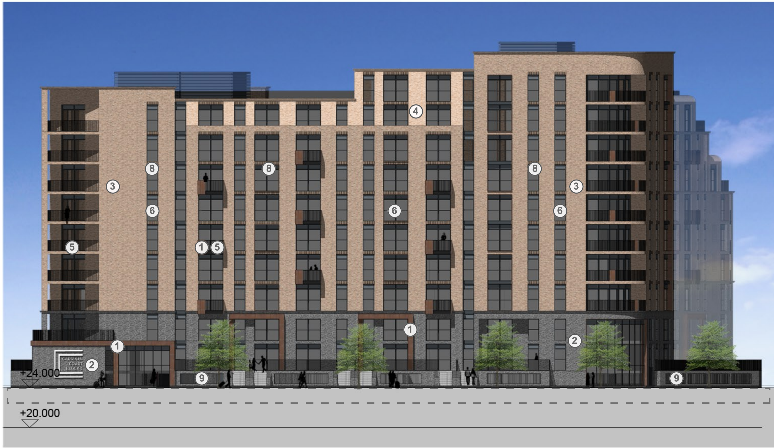
ELEVATION C - FACING EAST/NEW STREET