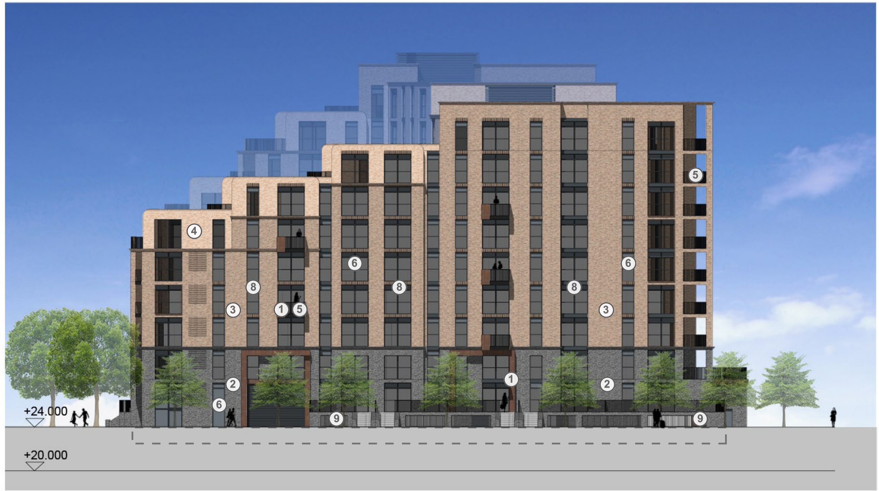
ELEVATION B - FACING SOUTH/BLOCK 2