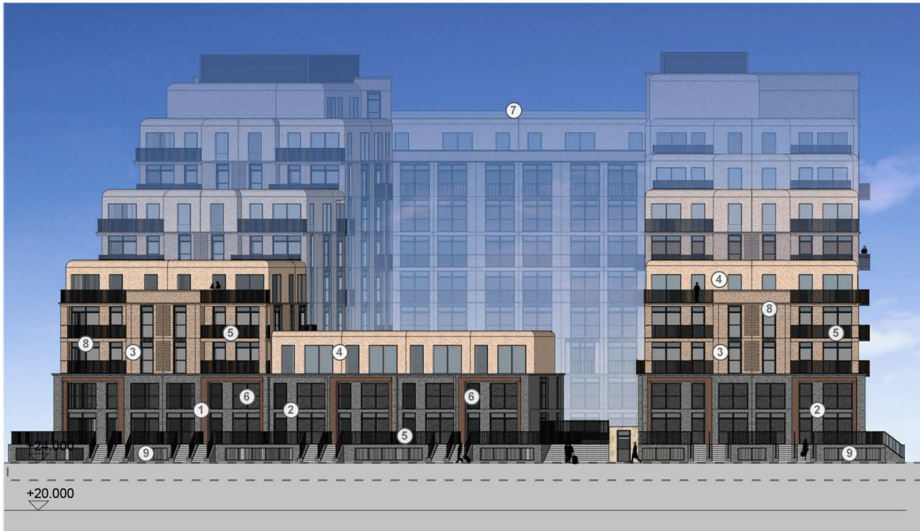
ELEVATION A - FACING WEST/WESTFIELD AVENUE