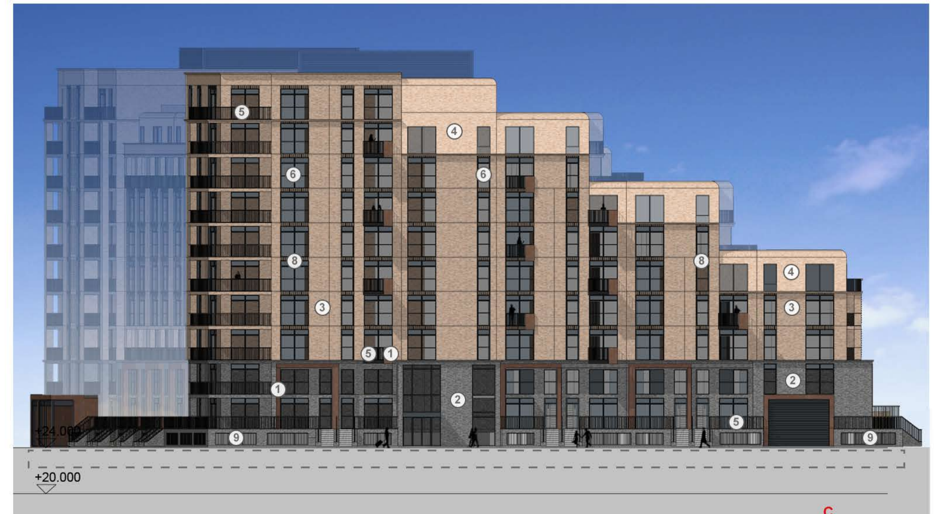
ELEVATION D - FACING NORTH/NEW CONNECTION TO WESTFIELD AVENUE