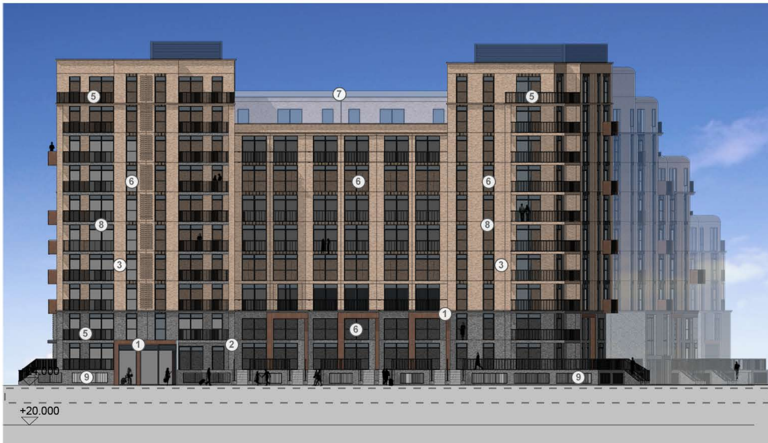
ELEVATION C - FACING EAST/NEW STREET