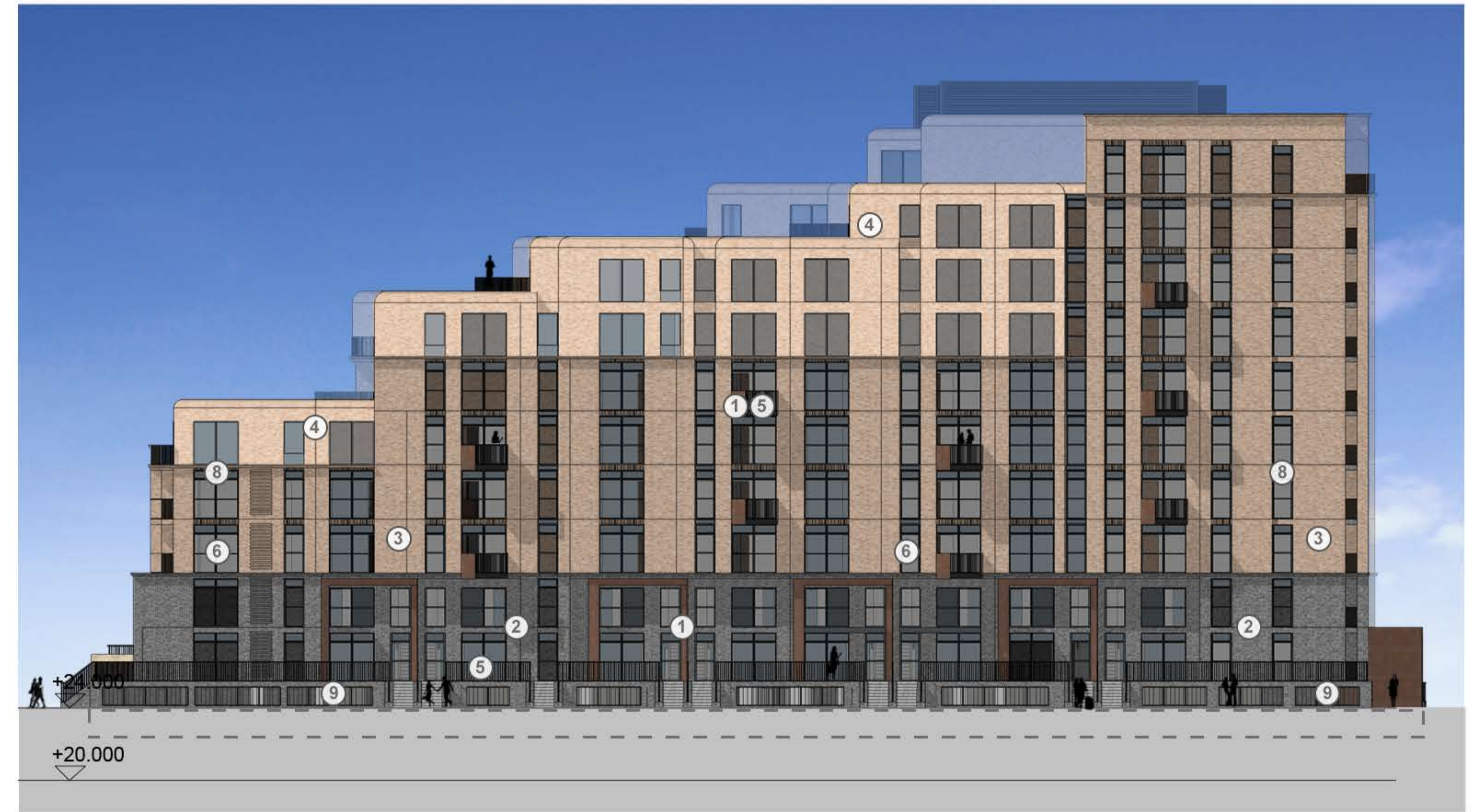
ELEVATION B - FACING SOUTH/BLOCK 3