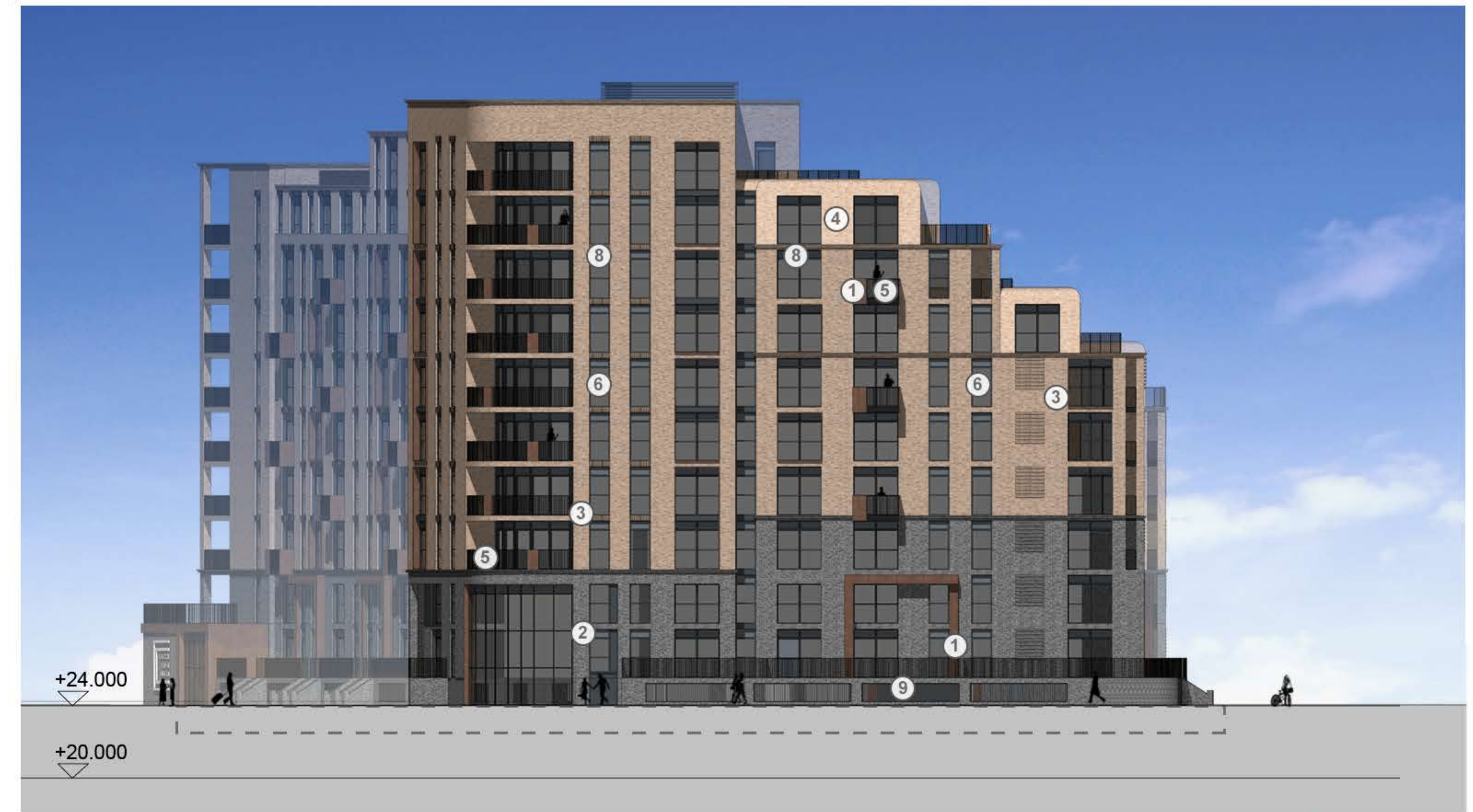
ELEVATION D - FACING NORTH/KINGFIELD ROAD