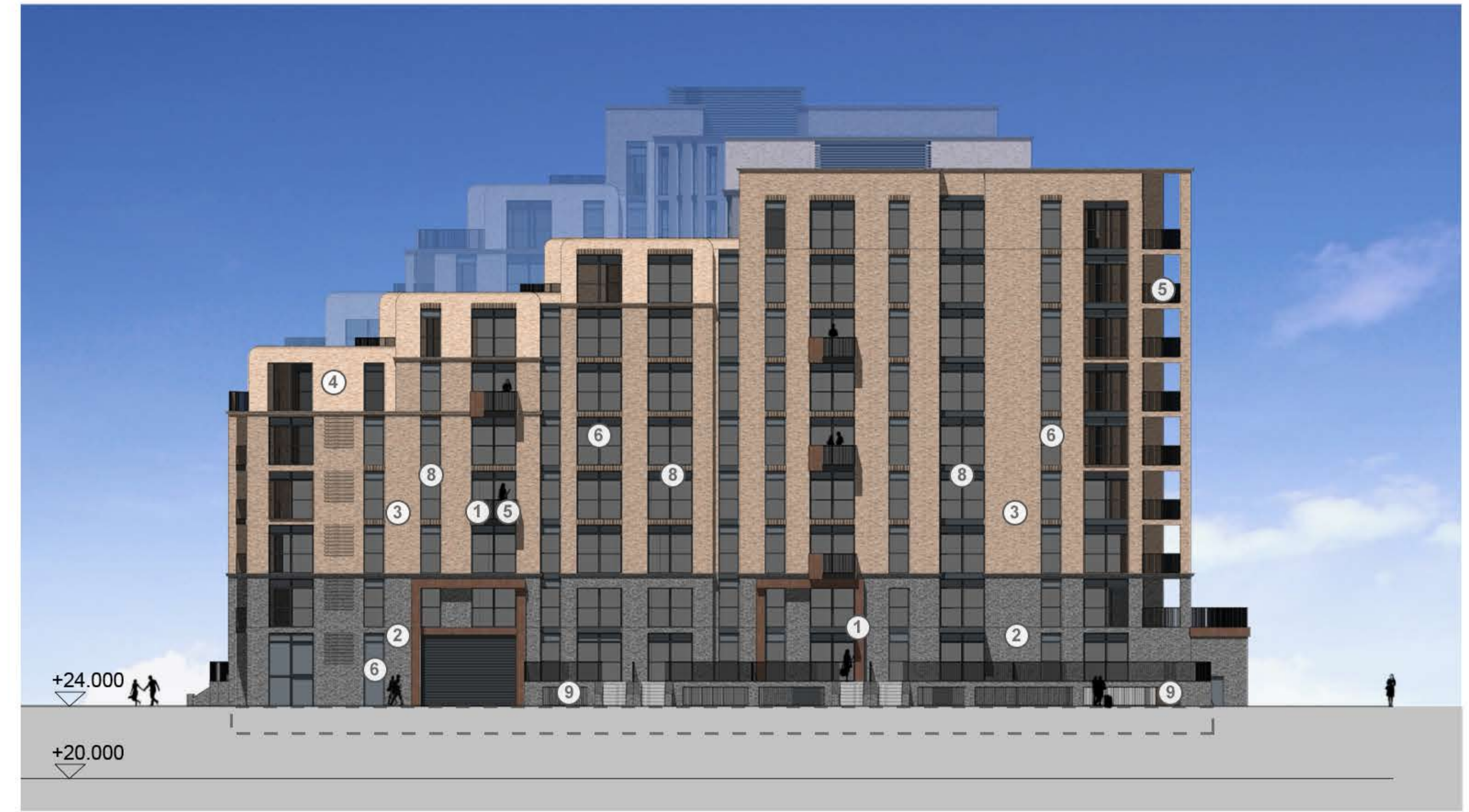
ELEVATION B - FACING SOUTH/BLOCK 2