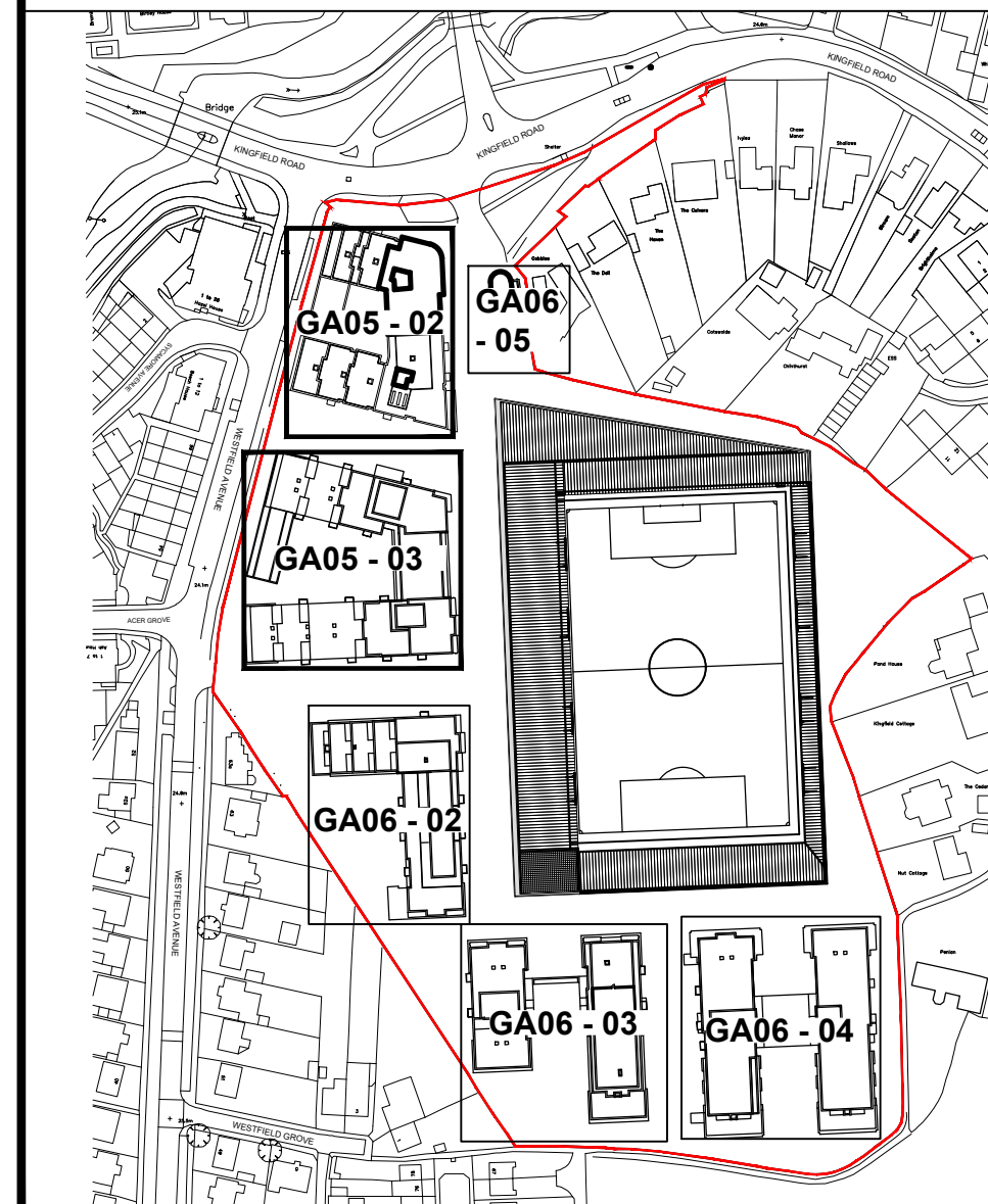
01 LANDSCAPE ROOF KEY PLAN - 1:1000