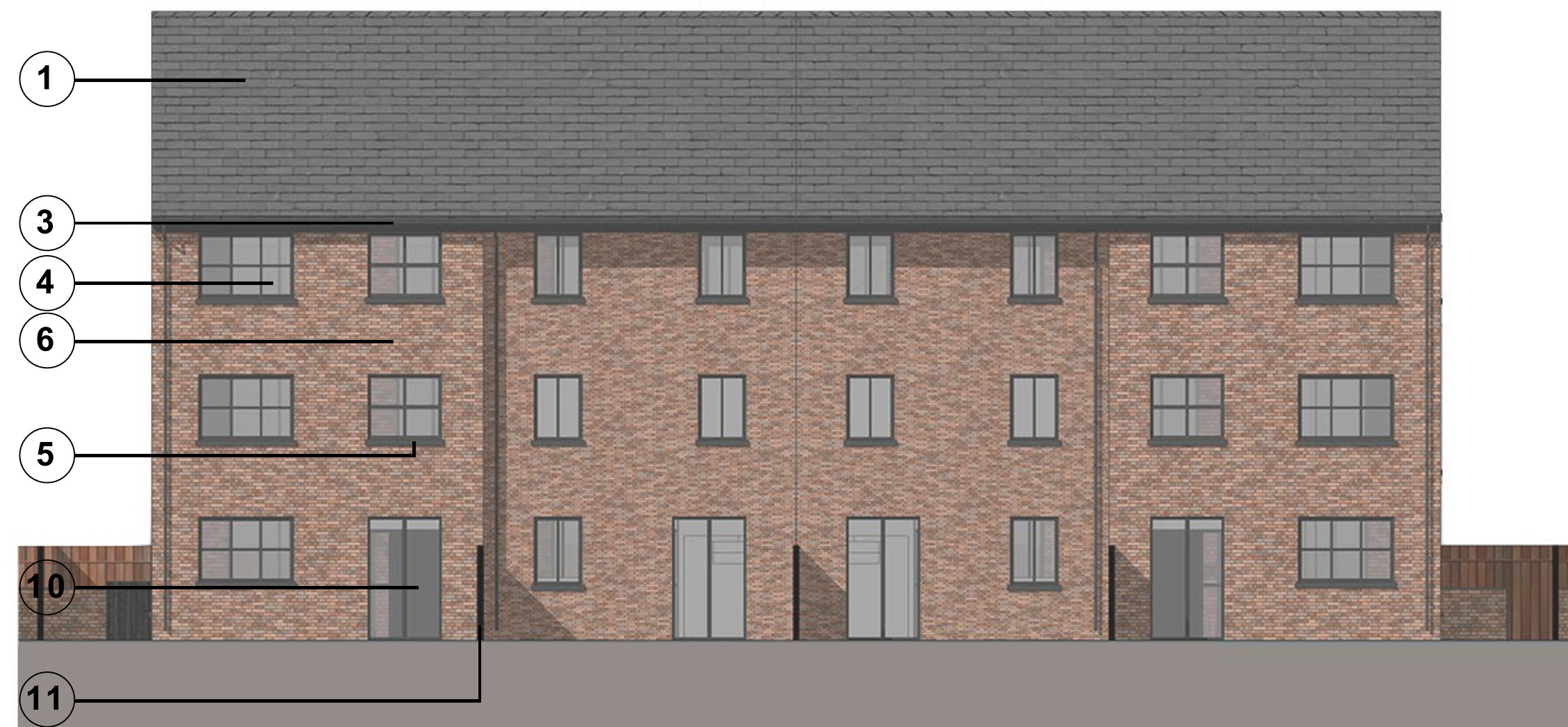
House Type 3 (Style 1) House Type 2 (Style 1) House Type 2 (Style 1) House Type 3 (Style 1)